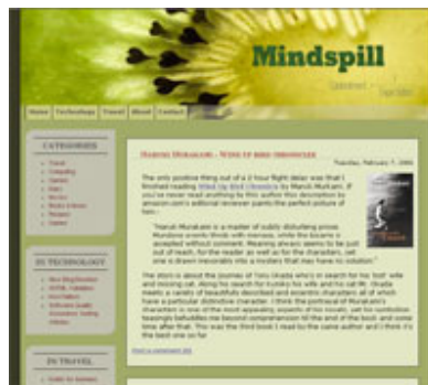
Figure 1 - Pattern preview

Description: A Free Conversant weblog pattern based on a dark green layout. The pattern uses a two column layout with the left hand side used for navigation and the right hand side for the page content. It also has a horizontal main menu beneath the main logo and a footer at the end of the page. There are no hard coded elements in the pattern so every component of the pattern can be modified by the user. The pattern is implemented using valid XHTML and CSS and can therefore be easily customised to suit different needs.