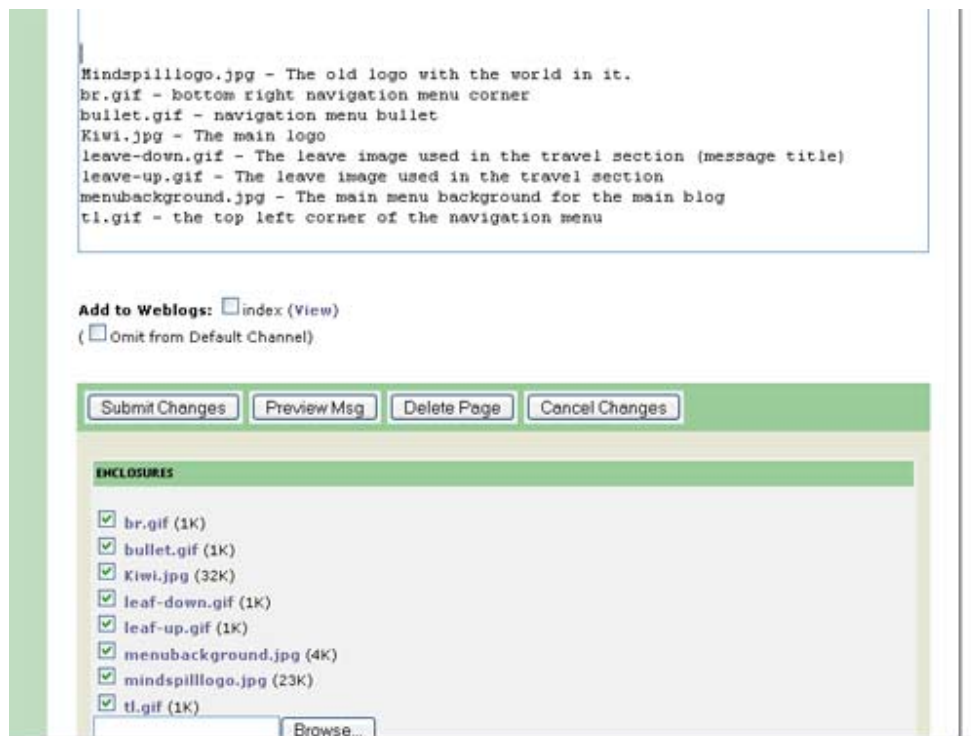
Figure 2 - Upload Images

http://www.mindspill.org/2/enclosure/tl.gif - Top Left Menu Corner